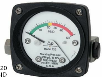
Model 120 0-50 PSID With Special 3 Color Dial

An optional maximum indication follower pointer provides automatic indication of maximum differential occurring during a time period or system cycle. Reversed pressure ports are optionally available to facilitate installation and readability depending on which side of a filter, etc., the instrument must be installed.