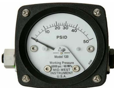
Model 120 0-50 PSID 2-1/2" Dial

A low cost differential pressure gauge for use in measuring the pressure drop across filters, strainers, separators, valves, pumps, chillers, etc., and for local flow indication and control.