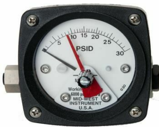
Model 120 0-30 PSID With Maximum Follower Pointer

Due to precision sizing of piston and body bore, leakage across piston will not exceed 15 SCFH air at 100 PSID at ambient temperature.