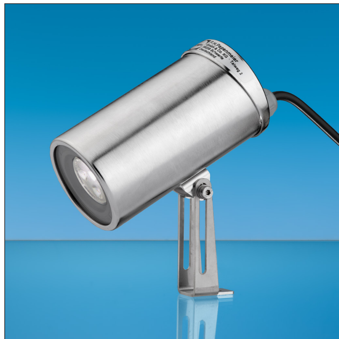
Lumistar luminaire USL 15-LED with hinged bracket